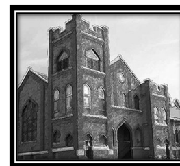
Viroqua UMC 221 S. Center Ave. Viroqua, WI 54665