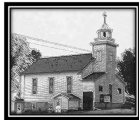
Liberty Pole UMC S6759 Hwy. 27 Viroqua, WI 54665