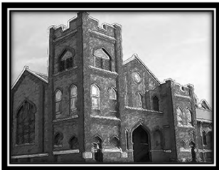
Viroqua UMC 221 S. Center Ave. Viroqua, WI 54665