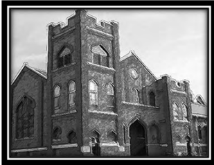
Viroqua UMC 221 S. Center Ave. Viroqua, WI 54665