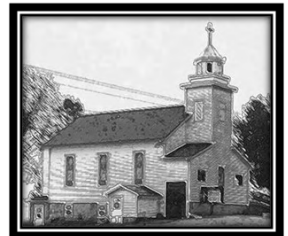
Liberty Pole UMC S6759 Hwy. 27 Viroqua, WI 54665