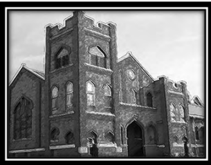
Viroqua UMC 221 S. Center Ave. Viroqua, WI 54665