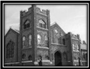
Viroqua UMC 221 S. Center Ave. Viroqua, WI 54665