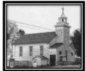
Liberty Pole UMC S6759 Hwy. 27 Viroqua, WI 54665